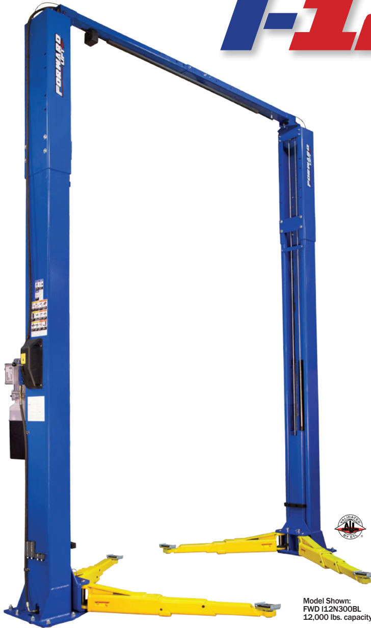
Model Shown: FWD i12N300BL 12,000 lbs. capacity