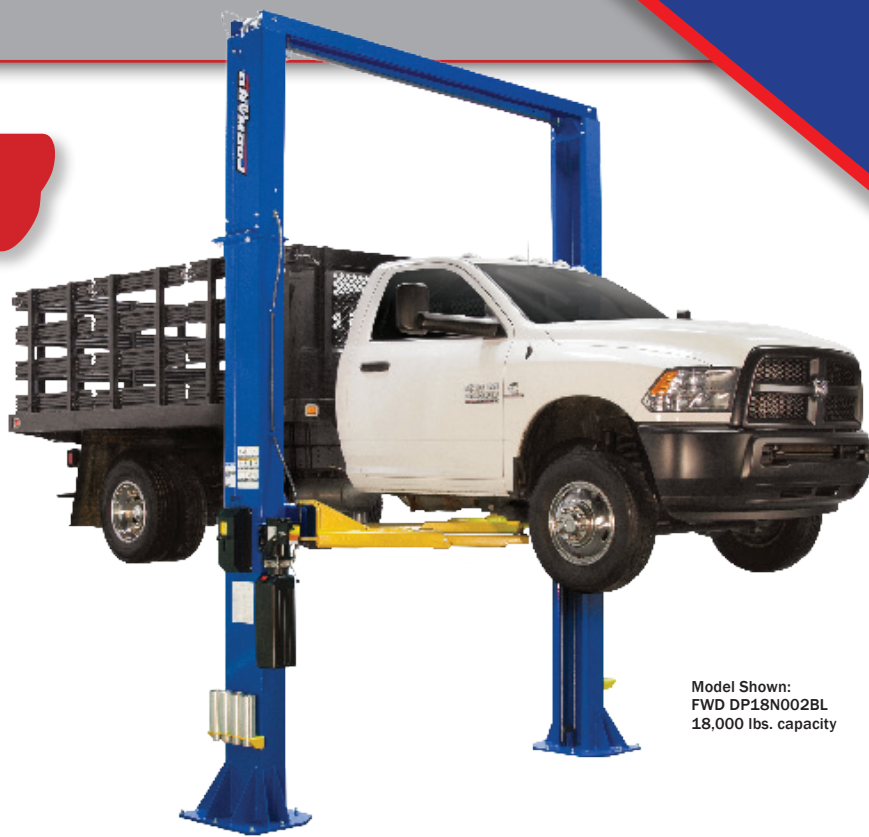
Model Shown: FWD DP18N002BL 18,000 lbs. capacity