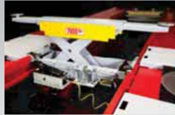
Alignment lifts come standard with two 7,000 lbs. capacity rolling jacks

Longer rear slip plate with auto locking steer designed to accommodate a greater wheelbase range for two and four wheel alignments.