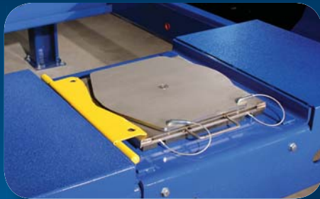
Photo shows optional stainless steel turning radius gauges

Alignment lifts come standard with two carbon steel turning radius gauges - roll back bar allows the gauges to be placed in the front or back of the slot while keeping a flat runway surface.