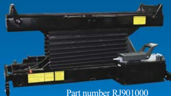
Part number RJ901000

Longer slip plate designed to accommodate a greater wheelbase range for two and four wheel alignments