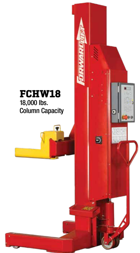
FCHW18 18,000 lbs. Column Capacity