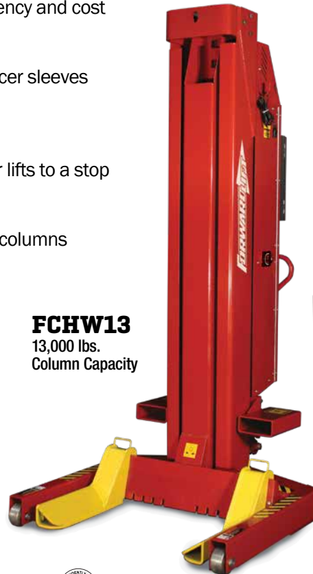
FCHW13 13,000 lbs. Column Capacity