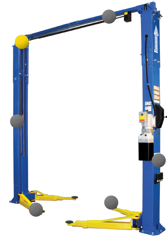
Model shown: I10 Two-Post Lift