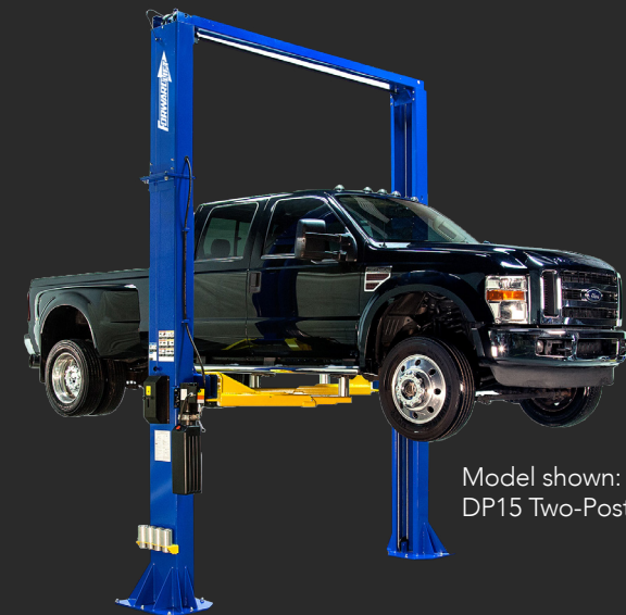
Model shown: DP15 Two-Post Lift