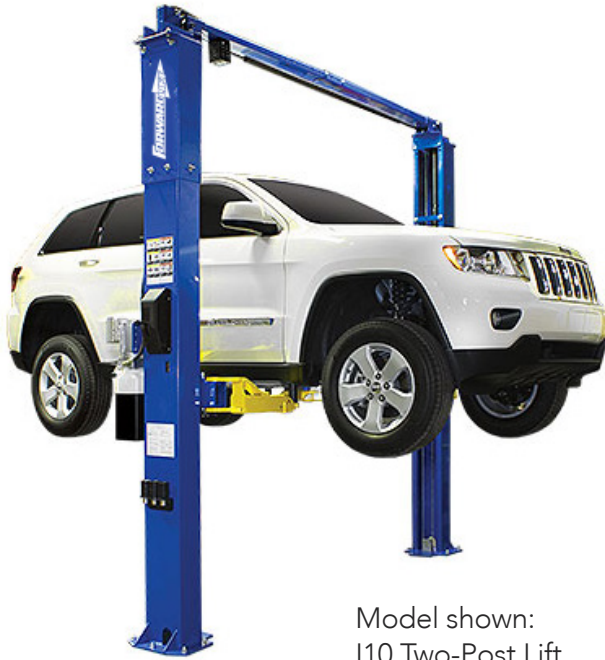
Model shown: I10 Two-Post Lift