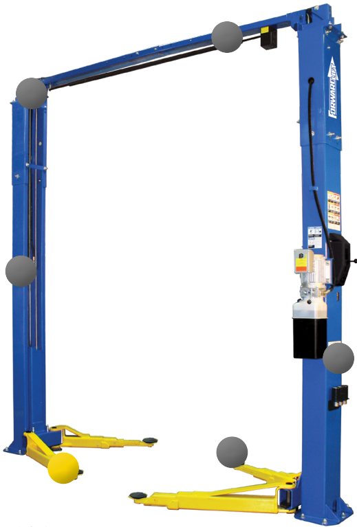
Model shown: I10 Two-Post Lift

Spot-Rite™ 3-Stage FrontArms are designed to accommodate vehicles both symmetrically and asymmetrically. This feature allows the technician to position the vehicle doors in front of or behind the column to prevent door damage.