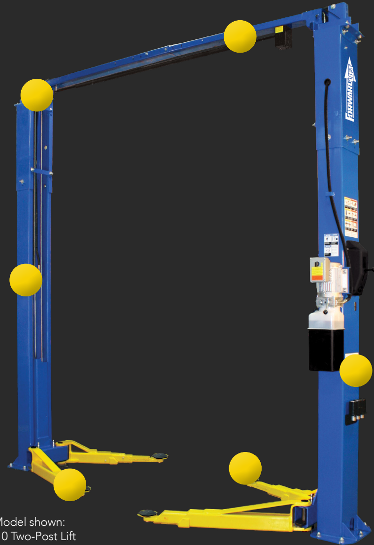
Model shown: I10 Two-Post Lift

Click the button to find out more about the lift that sets Forward Lift apart from the rest.