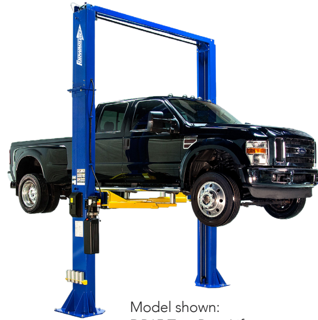
Model shown: DP15 Two-Post Lift

Forward Lift offers eight different two-post lifts. Learn more about the product features with this quick and easy visual tour!